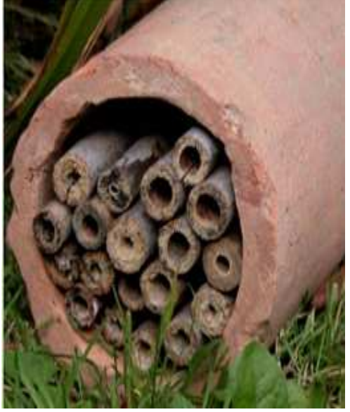
A clay pipe with bamboo canes pushed inside

The pictures show 3 very easy ways to help solitary bees, and other insects will use them too.